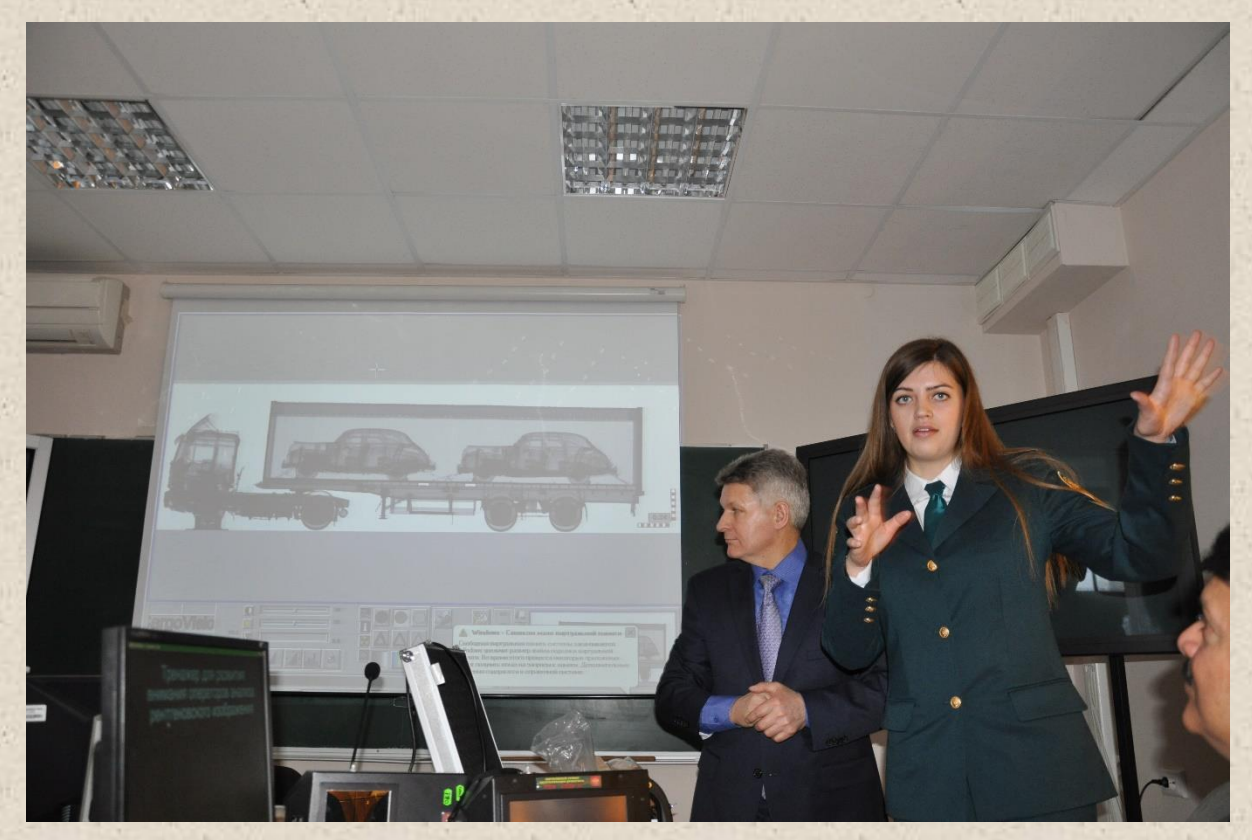
I had the unique privilege of delivering a lecture and PowerPoint presentation on the subject of Narco-terrorism to the students.